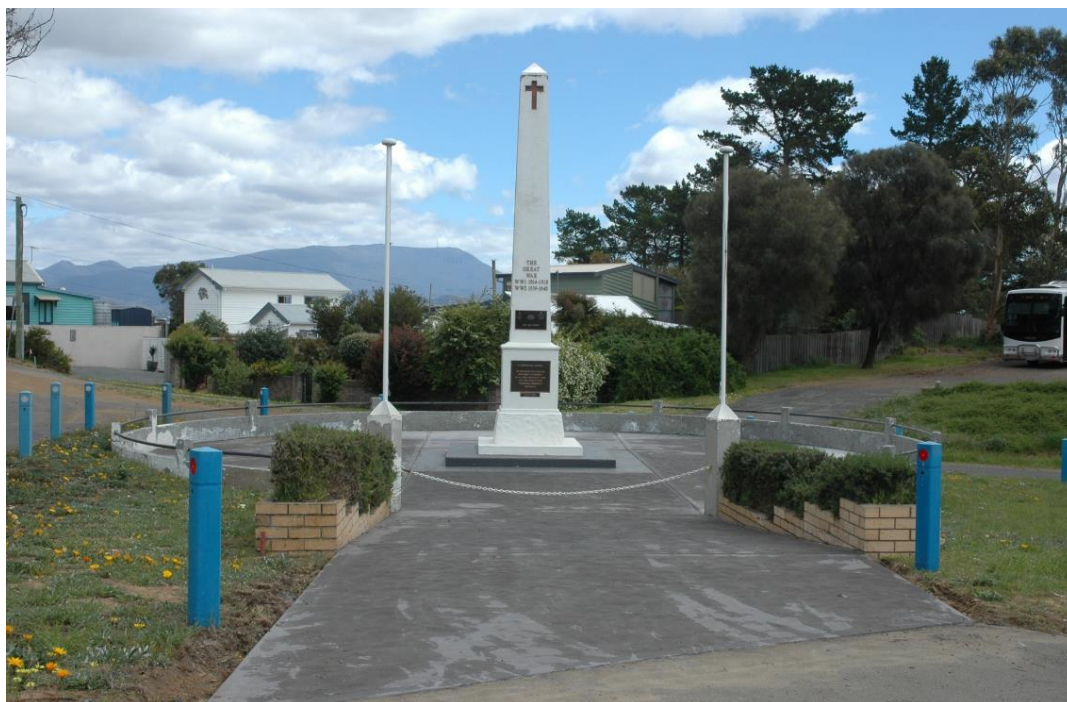
South Arm War Memorial